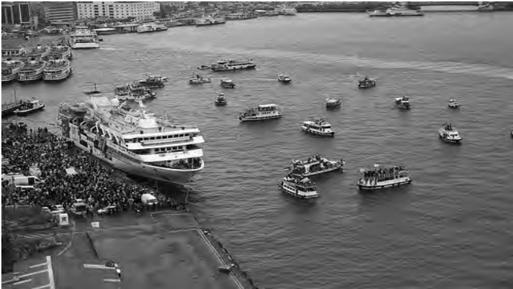
Freedom Flotilla leaving Turkey

This essay, as well as the one which follows, were written in late 2009 in the aftermath of Israel's barbarous attack on Gaza.